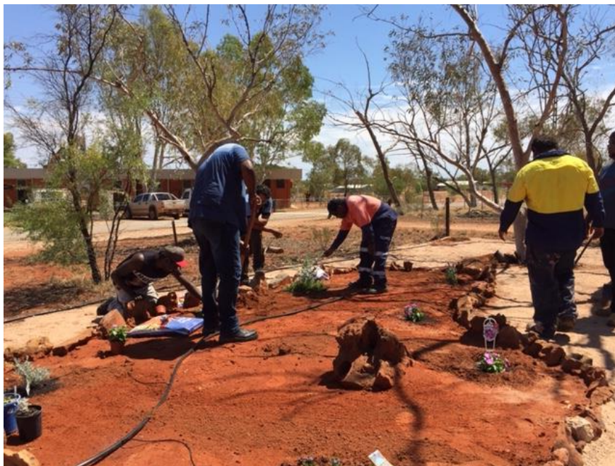
Santa Teresa community members attending the garden in front of the grotto at Santa Teresa